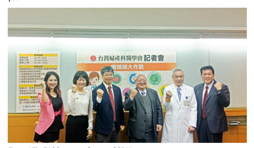
Figure 1 The TAOG press conference of GDM.

In order to support infertile married couples to fulfill their wish of having a child and to reduce their economic burden for in-vitro fertilization (IVF) procedures, the Ministry of Health and Welfare has expanded the scope of the subsidy for IVF, from low-income households and middle-low-income households to all infertile couples, effective on July 1, 2021. It is estimated that this will benefit 23,000 to 28,000 infertile couples each year.