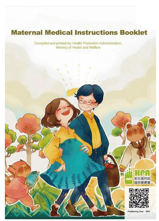
Figure 2 The new version of Mother's Book published in February, 2021